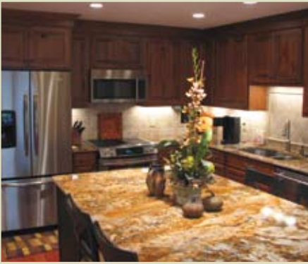
201 MOON RUN $498,000 (FURNISHED)