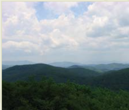
524 BRANLAIRE DRIVE $1,500,000 (FURNISHED)