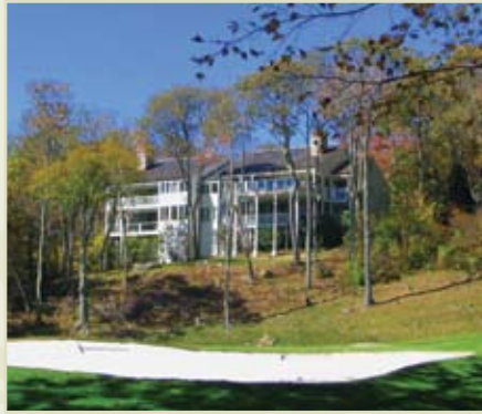
204 MOON RUN $525,000 (FURNISHED)