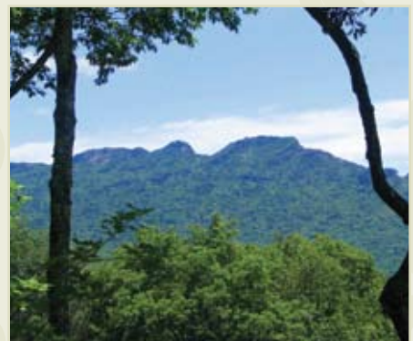
1037 RIDGE DRIVE $2,375,000 (FURNISHED)