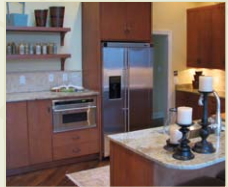
105 CHESTNUT TRAIL $1,150,000 (FURNISHED)