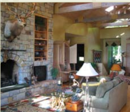
1402 VISTA KNOLL $1,999,999 (UNFURNISHED)