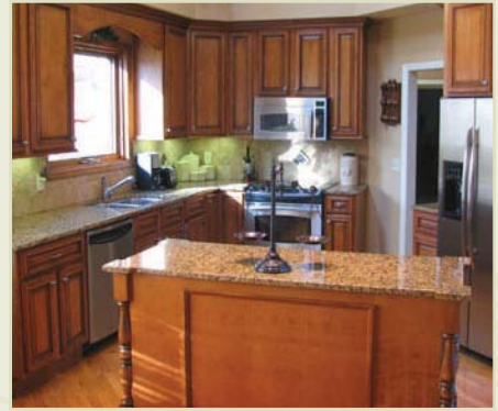
110 RIDGE DRIVE $795,000 (UNFURNISHED)