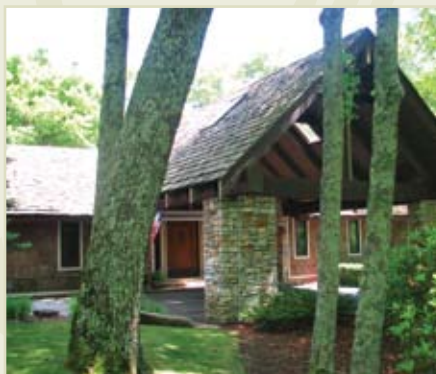
209 RIDGE DRIVE $2,350,000 (FURNISHED)