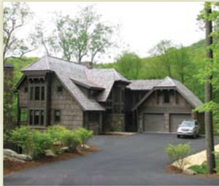
1202 CRANBERRY COVE $1,100,000 (FURNISHED)