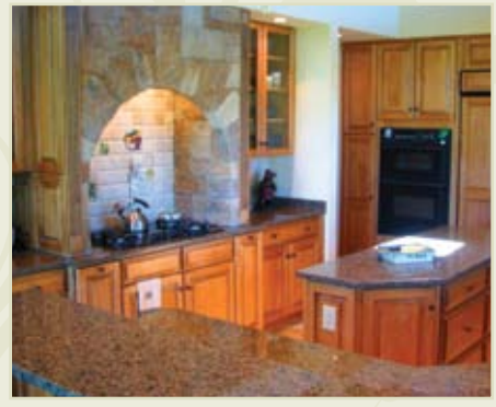
1604 FOREST RIDGE DRIVE $1,750,000 (FURNISHED)