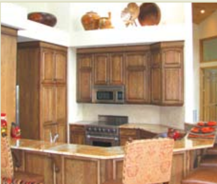
1519 CRANBERRY COVE $1,400,000 (FURNISHED)