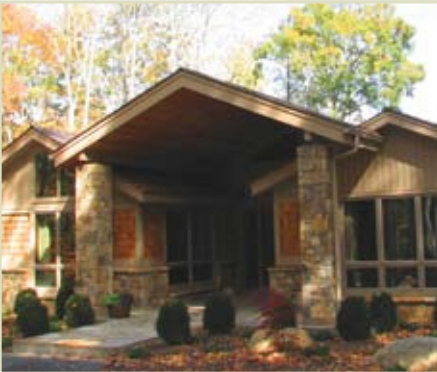
1137 VISTA WAY $1,050,000 (FURNISHED)